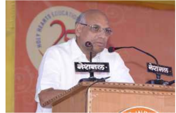
Shri Ramesh Bais Governor, Maharashtra