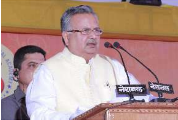
Dr. Raman Singh Chief Minister Chhattisgarh