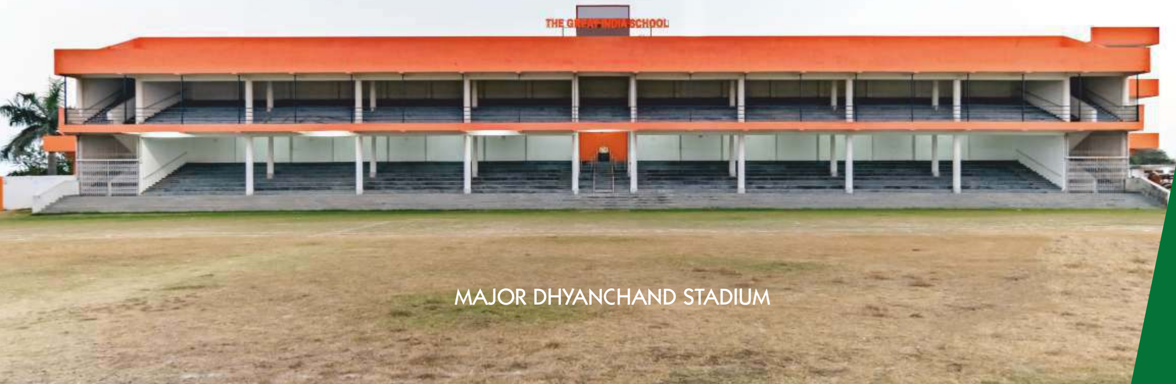
MAJOR DHYANCHAND STADIUM