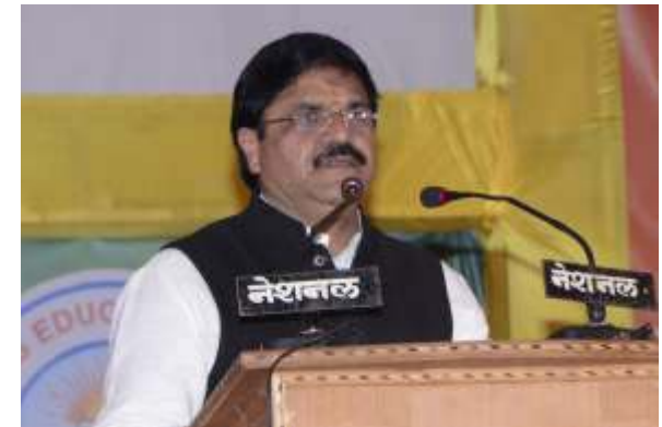
Shri Pramod Dubey Mayor Raipur