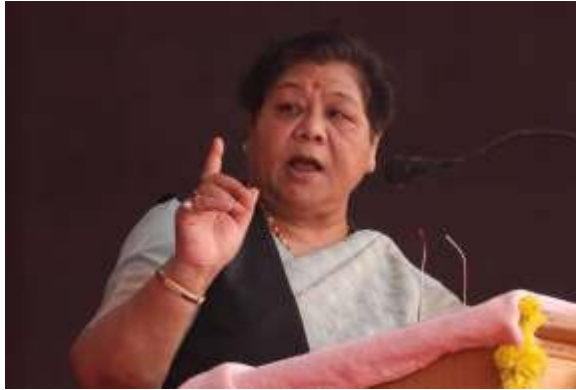
Sushree Anusuiya Uikey Governor, Chhattisgarh